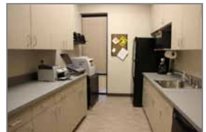
Work room provides built-in cabinets with sink and refrigerator