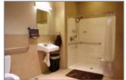
Restroom features full walk-in shower and heated tile floor