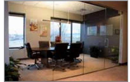
Conference room features full glass wall off reception area